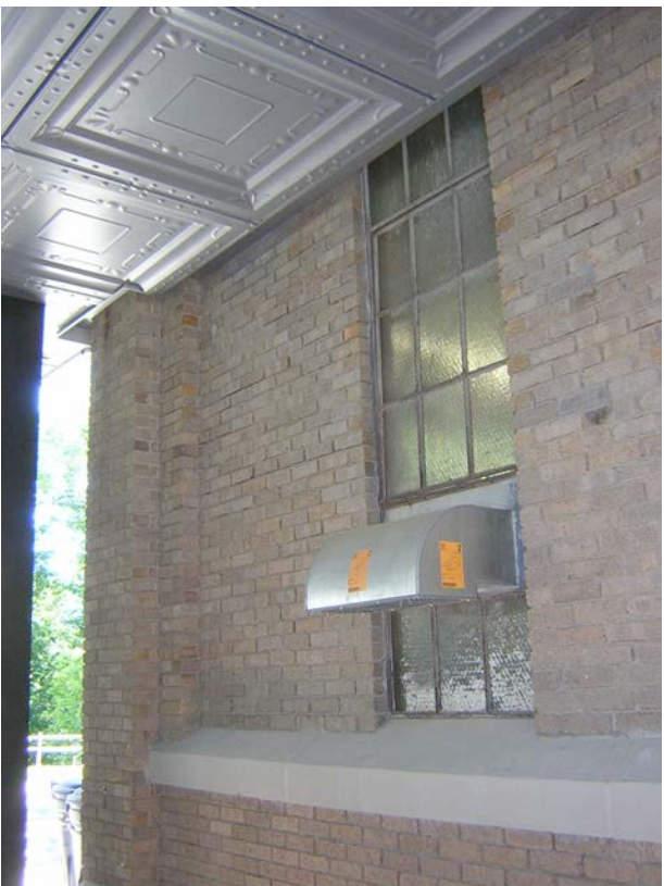
Figure 3. Lack of opening protectives in fire barrier between Rand and Milstein Hall (photo by J. Ochshorn, June 2013)

Third, opening protectives for the required fire barrier between Rand and Milstein Halls at the ground floor level were never provided. As shown in Figure 3, the existing windows and exhaust ducts in that location have neither opening protectives nor fire dampers.