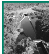
"New York's Canals: What the World Is Coming To"

lion in a new round of grants. Packets of information will be mailed to all chief elected officials this fall. For more news about these and other grants, keep an eye on the Quality Communities Clearinghouse website home page at www.qualitycommunities.org .