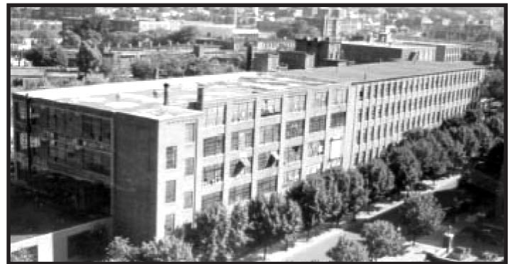
After sitting dormant for years, this downtown manufacturing building in Syracuse is starting its life over as an upscale loft apartment building.

With the shift of focus by some businesses from cities to suburban and rural areas, many large buildings once used for manufacturing have fallen into dormancy. The City of Syracuse, however, is effectively using the progressive provisions Appendix K to convert a former factory into a condominium complex. Since Appendix K evaluates the past use of a building and compares the previous fire and life safety hazards to the proposed occupancies, the developer is offered options on how to make the project comply. In this case, the manufacturing building is far larger than the code would allow for a