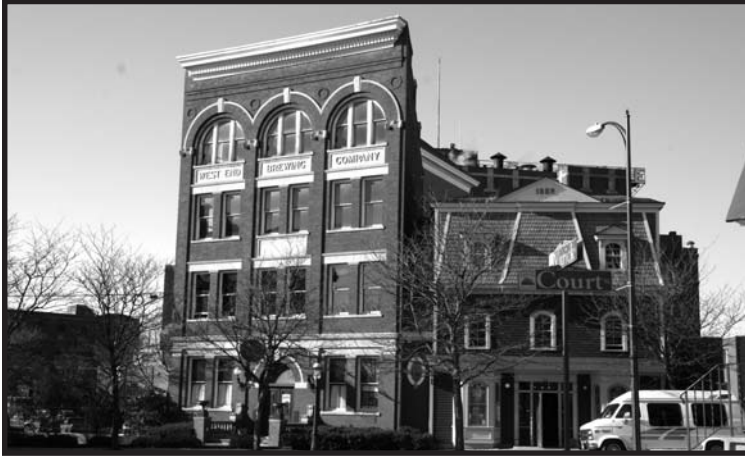
This historic brewery building is the local anchor at one end of Varick Street, a significant part of Utica's Main Street master plan.